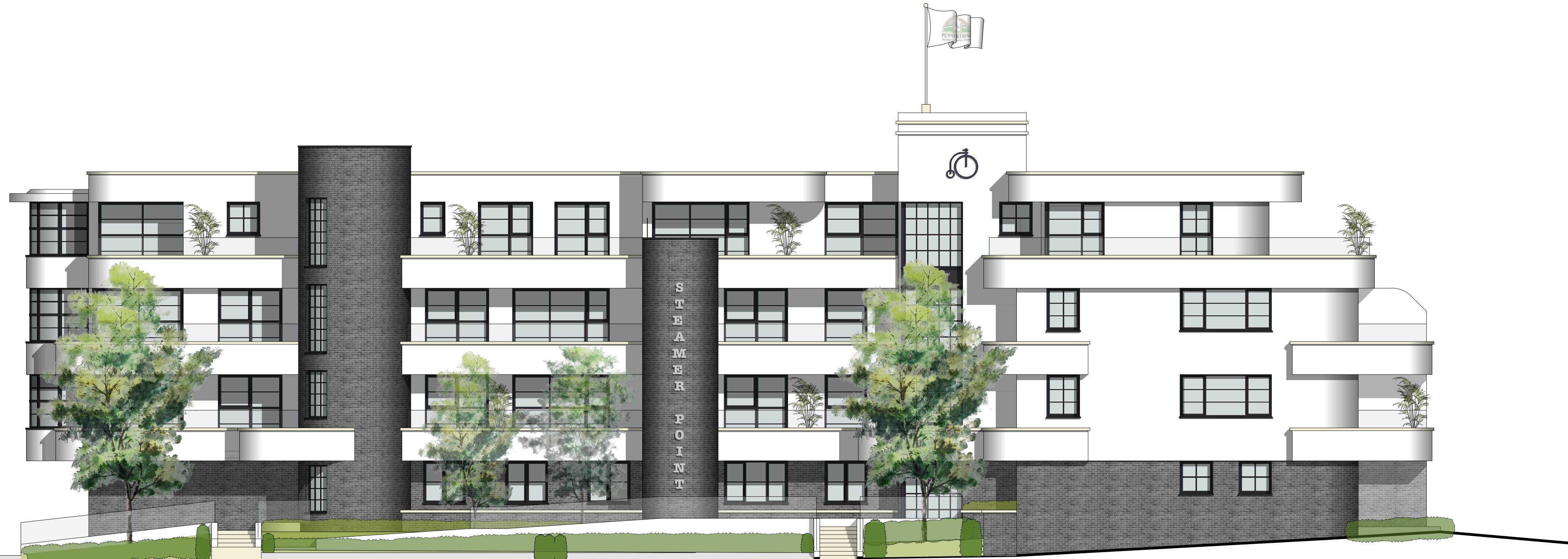
Front Elevation (East) Scale 1:100 @ A1