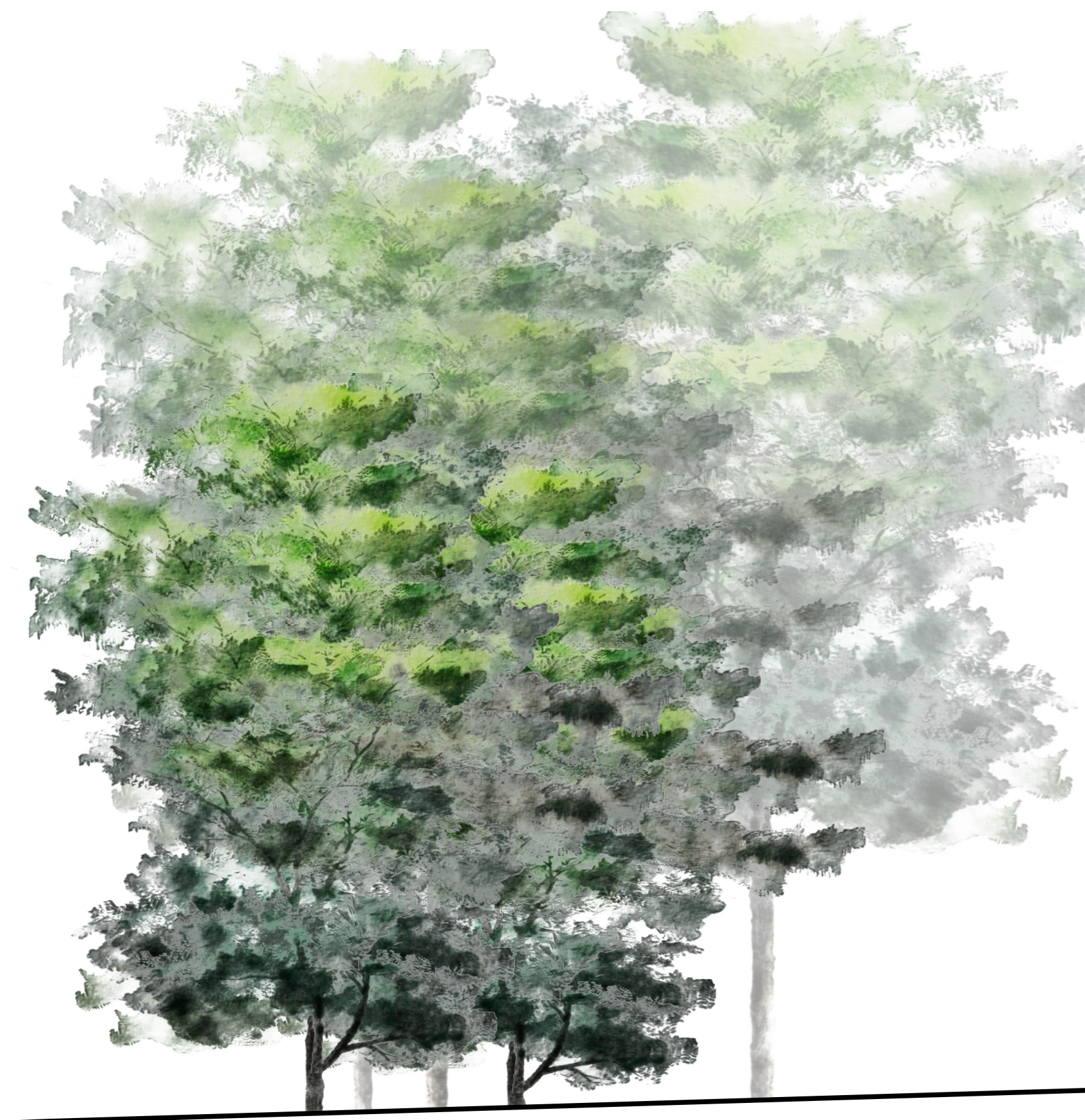
(tree height approximate / for illustration only)