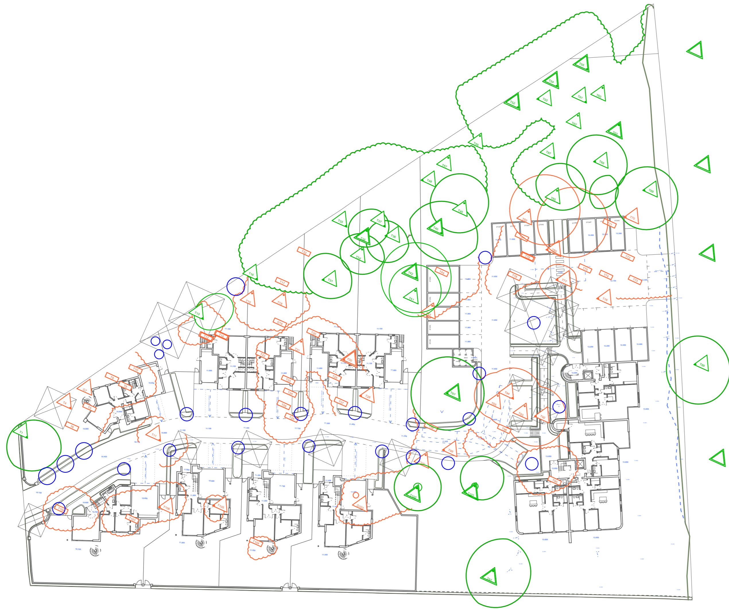
Site Plan (Refused Planning Application) - Tree Overlay Scale 1:500 @ A1